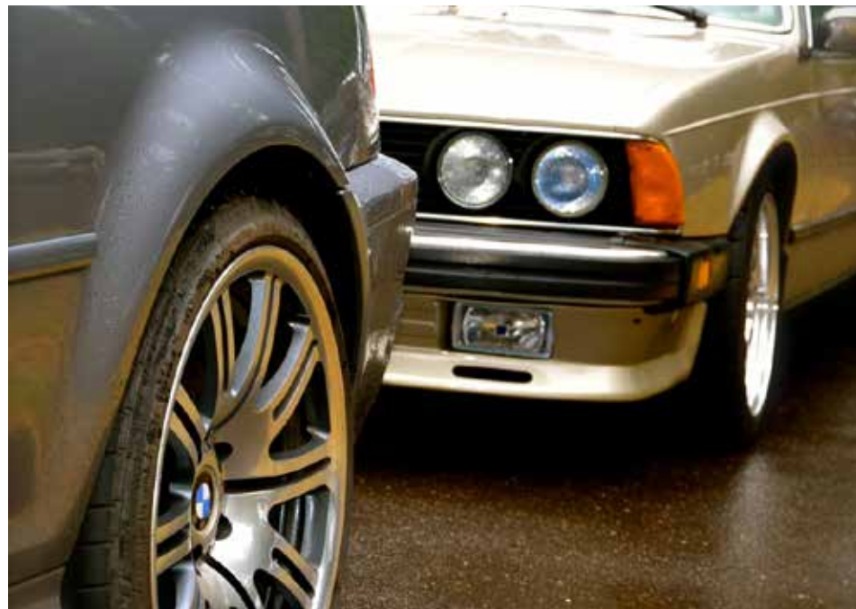
Northwest Ramble by Dan Hones